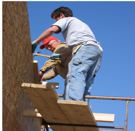
Volunteers helping to build a Habitat house in Montrose, CO.

Since our inception in 1991, we have improved the lives of more than 30 families in Montrose County.